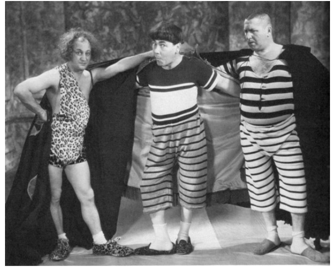
(Never a dull moment in Stooge-land. Above: typical high jinx on the set of An Ache in Every Stake (1941) and Restless Knights (1935).