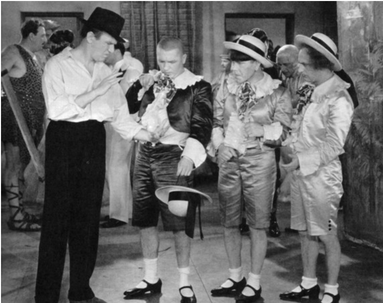
After the Stooges breakout in the musical rhyming Woman Haters 1934 the Stooge shorts infrequently featured the boys doing some sort of song or dance or both.

The Stooges' success at Columbia was so immediate and profound that the studio went to great lengths to promote their shorts as much as they did their features.