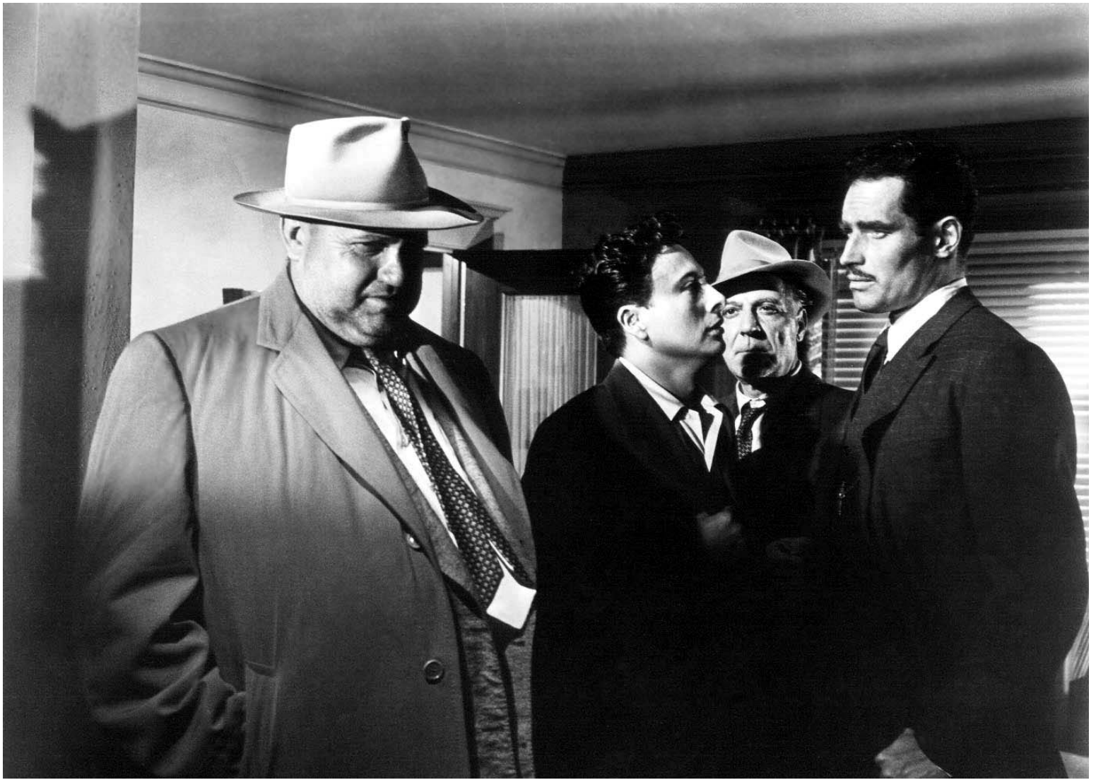
(Above: as the corrupt police captain, Hank Quinlan, with actors Charlton Heston, Valentin de Vargas and Joseph Calleia in Touch of Evil 1958. Right: with Edward G. Robinson and Loretta Young in The Stranger 1946.)

It is said of time, that it heals all wounds - perhaps. Certainly, in the case of critical respect for Citizen Kane and, to a lesser extent, The Magnificent Ambersons , time has revised and exonerated Orson Welles' creative zeal. But for their time, neither film seemed worthy of his preceding reputation as a genius. With back to back flops to his detriment, RKO – no longer interested in Welles' services as a film maker - unceremoniously let it be known throughout the industry that they considered their ex 'boy wonder' a terrible risk.