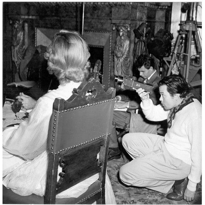
(Top left and right: Welles hard at work on the set of The Magnificent Ambersons 1942. Left: with the cast and crew of the film, shooting the winter confrontation between Isabel (Dolores Costello) and George (Tim Holt).