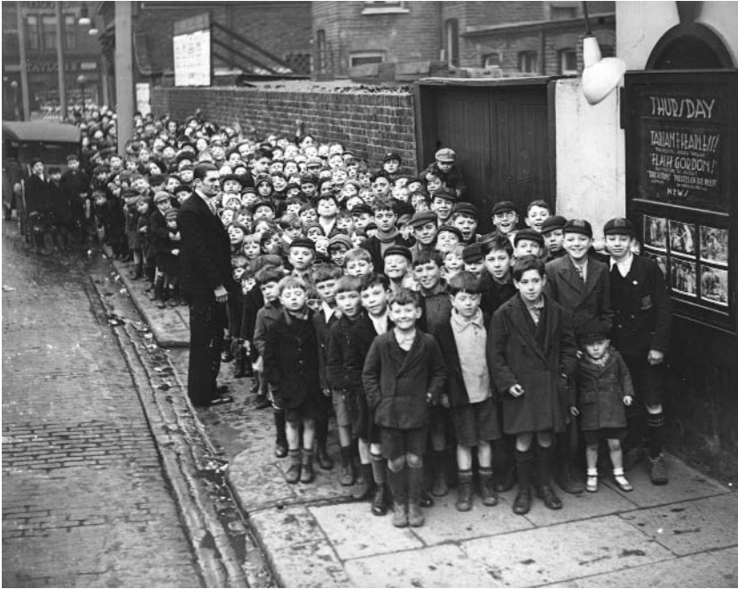
10. A Saturday matinee queue in Plaistow, east London, 1937.

television and video gave children greater access to ‘unsuitable’ material than ever before. Subsequently, controversies about all kinds of new media have followed in quick succession, with recent targets including playground text-messaging and Internet chatrooms. 6