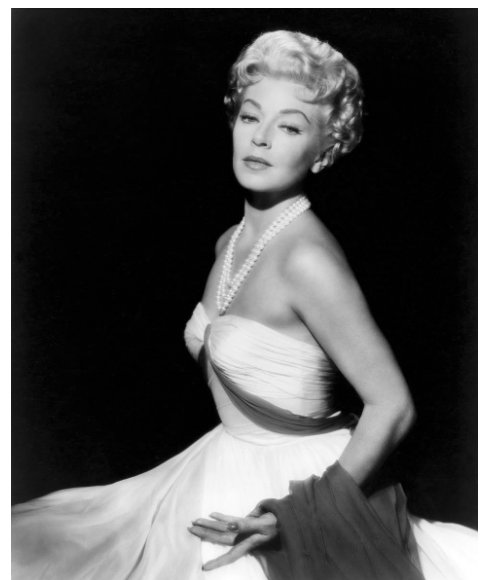
(Conflicting views: top, a repentant Lana delivers a dramatic monologue – part apology/part fiction at the inquest following Stompanato's murder.

To her credit, Cheryl Crane – who, remarkably harbored no ill will towards her mother - returned to Lana's side for this final act in her life. On June 29 th , 1995, Lana Turner died of throat cancer – her personal demons finally resolved.