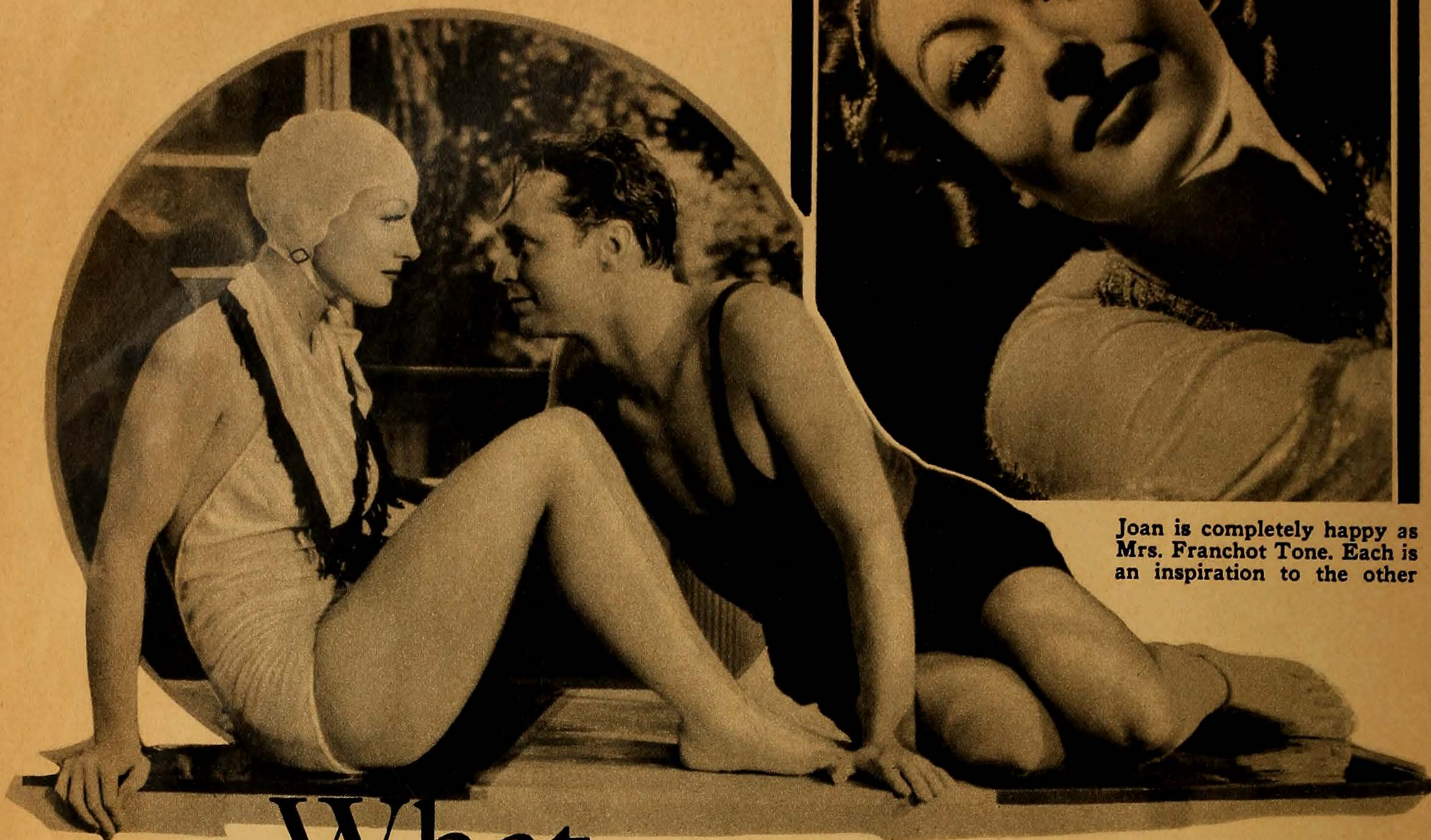
Joan is completely happy as Mrs. Franchot Tone. Each is an inspiration to the other