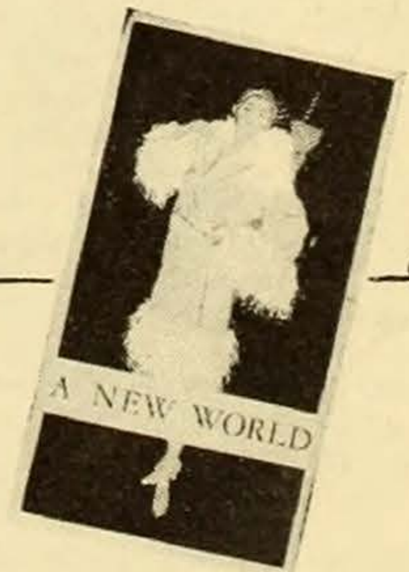
Jobyna Ralston, the exquisite Paramount star who is now appearing in "Special Delivery," is here seen wearing the Jobyna model of the Arch Preserver Shoe, named in her honor.

Look for trade-mark on sole and lining. Sold by 2000 dealers. All widths, AAAA to E. Made for women, misses and children by only The Selby Shoe Co., Portsmouth, O., for men and boys by only E. T. Wright & Company, Inc., Rockland, Mass.